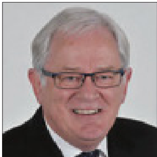
The Hon Andrew Robb AO Chair of the ACETIE Organising Committee Former Australian Minister for Trade and Investment 安德鲁·罗布，澳中博览会组委会主席，前澳大利亚贸易投资部长